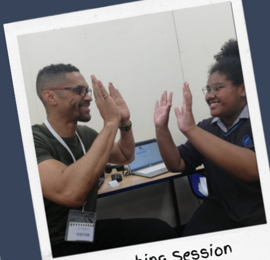
Coaching Session Successes!