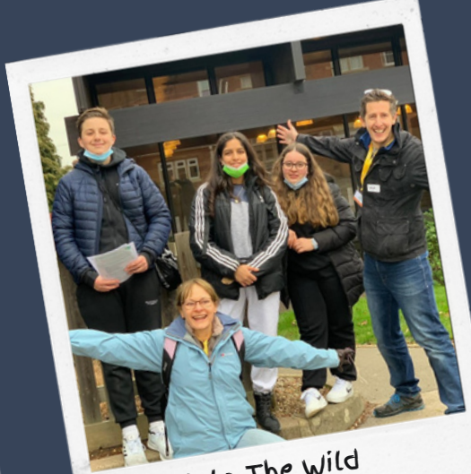
Into The wild adventures