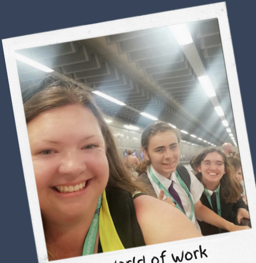
World of work discovery