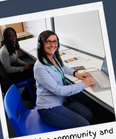
Coaching community and support