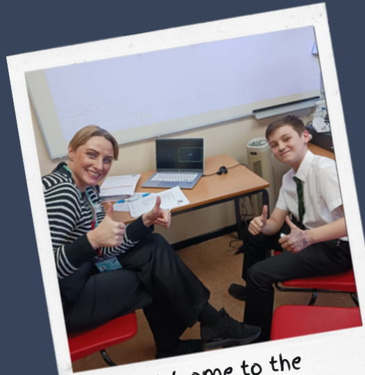
Welcome to the programme!