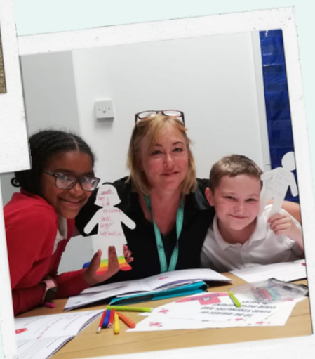
Discovering our strengths