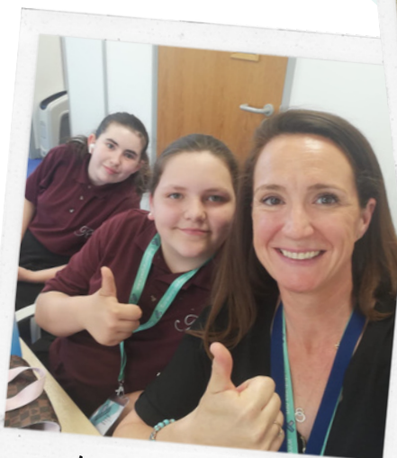
Inspiring futures together