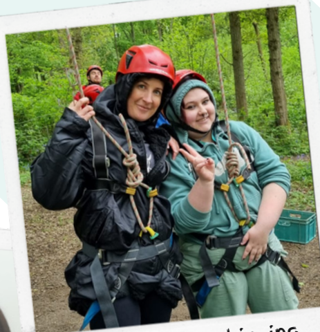
Setting and achieving goals!

If you have any questions about the opportunity, please email our Volunteering Team on volunteering@yesfutures.org . We look forward to hearing from you!